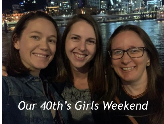
Our 40th's Girls Weekend